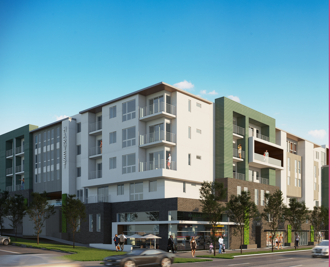
*THIS IMAGE IS A CONCEPTUAL RENDERING THAT IS SUBJECT TO CHANGE